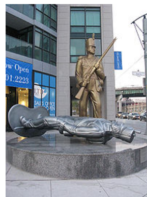
Douglas Coupland's 'Monument to the War of 1812' (2008) Toronto

Canada -- What a history and what a country -- an sovereign country of First Nations peoples, French and English settlers, and immigrants from every corner of the planet! In 2009, two institutes joined forces to create The Historica-Dominion Institute (HDI) , the largest, independent organization dedicated to Canadian history, identity and citizenship. The work of this dynamic organization is to build active and informed citizens through a greater know-