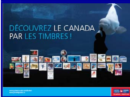
Canada Post's Stamp Month Teachers' Kit Poster

Canada Post's 2007 Stamp Collecting Month Pack will help teachers across Canada put a stamp on learning. This is your guide to the world's most popular hobby!