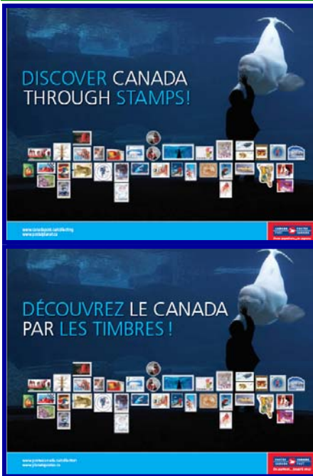
Canada Post's Stamp Month Teachers' Kit Poster

Canada Post's 2007 Stamp Collecting Month Pack will help teachers across Canada put a stamp on learning. This is your guide to the world's most popular hobby!